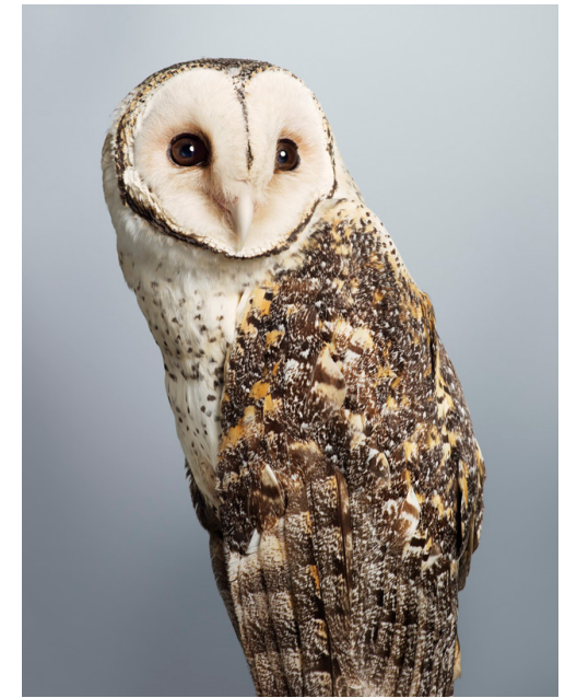
'Tani No. 1' Masked owl Prey 2014

“Through a unique combination of technical skill, ingenuity, patience and empathy, Leila creates objects of art that are luxurious visual pleasures in themselves. By abstracting her subjects from their accustomed context, she demands focus on form, composition, and colour. Stark and warm, objective and celebratory at the same time, her photographs not only enhance our personal surroundings by their own decorative presence, but expand our joyous understanding of the world we inhabit, yet customarily see so incompletely in the short time allotted to us.”