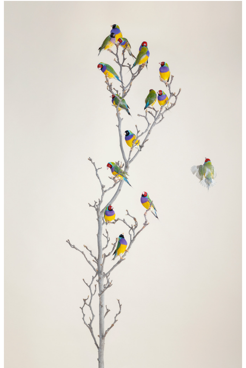
Branch No. 1 2022