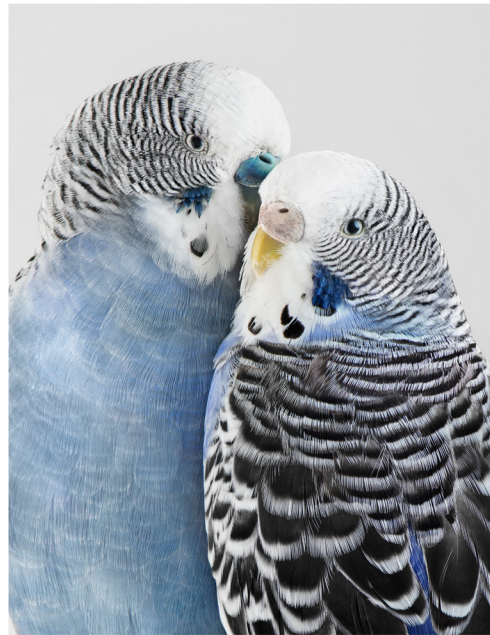
'River and Cloudy' High Society 2019