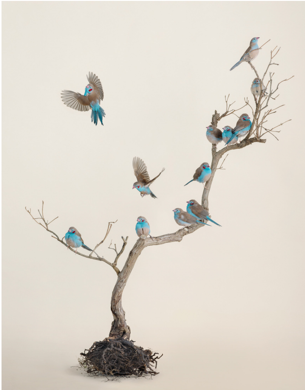
Left: 'Light enters' Red-cheeked Cordon-bleu bonsai, 2022. Below: 'Light enters' Cut-throat, 2022