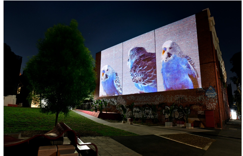
Nature is not a place to visit. It is home. Peel Street Park Projection Project for Yarra City Arts 2020

“Upon watching Leila Jeffreys’ video Nature is not a place to visit. It is home I am reminded of exquisite 16th to 17th century Japanese folding screens known as Byōbu. The term ‘byōbu’ means ‘protection from wind’ and was used to allow interior spaces of Japanese palaces, temples, shrines to open onto adjoining gardens.