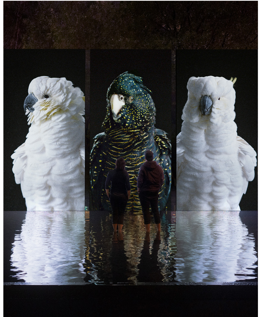
Temple (Installation view) VIVID Sydney 2022

Wellington Dam Living Legacy Forest feature in The Plant Hunter