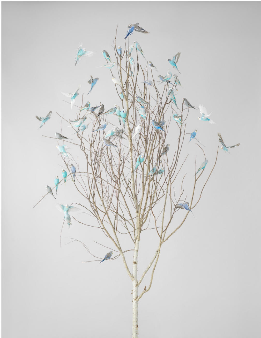
Blue Blossoms 2 High Society 2019