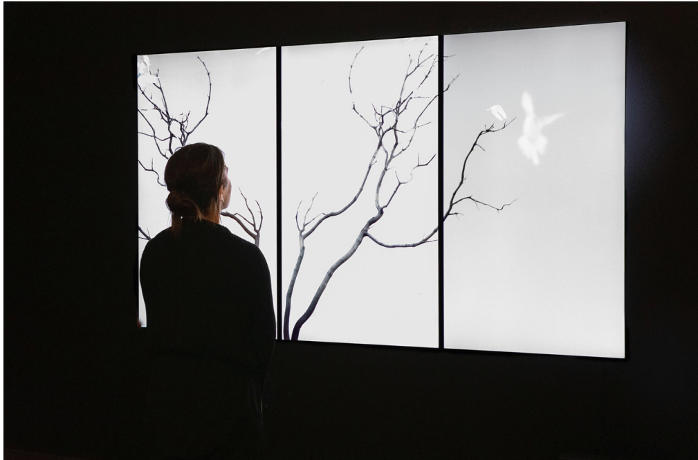
Nature is not a place to visit. It is home. Installation view at Manly Art Gallery & Museum 2021