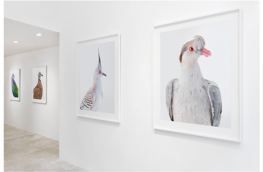
Ornithurae installation view Olsen Gruin Gallery, New York 2017