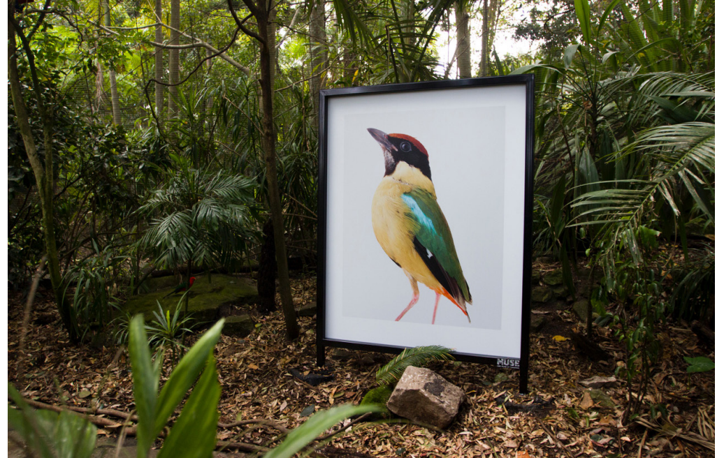
Clockwise from top left: Biolela Wild Cocakoos installation view Olsen Gallery, Sydney; Leila on location; Muse at Taronga Zoo, Sydney featuring 'Noisy Pitta'