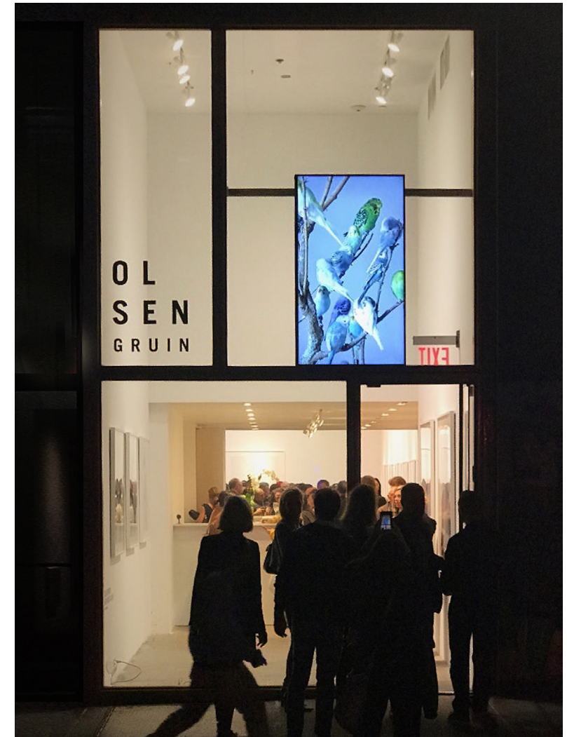
Ornithurae opening night Olsen Gruin Gallery, New York 2017

Interview With A Cockatoo (or Two) (Independent), Winner of the 'People's Choice Award' for the 2013 Head On Moment Photobook Awards.