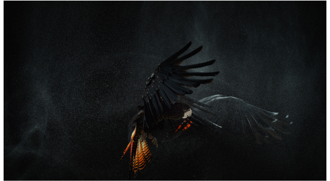
Temple Video Still 2022