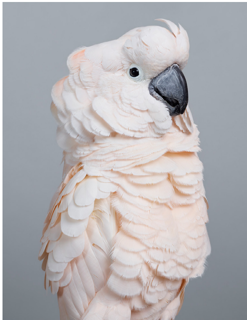
'Cyril' Moluccan cockatoo Ornithurae 2017