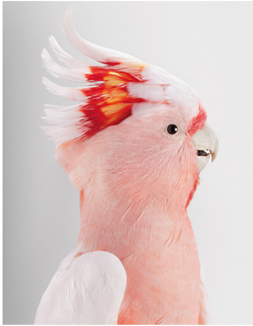
'Neville' Major Mitchell's cockatoo Biolela - Wild Cockatoos 2012