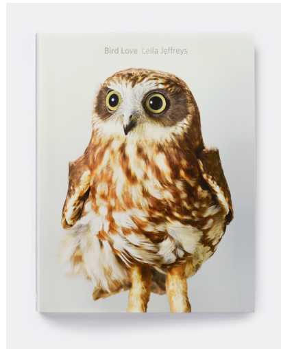
Bird Love Monograph 2015