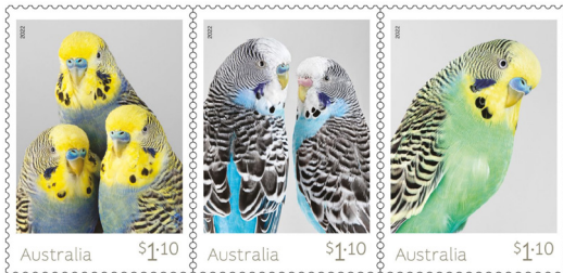
Australia Post Stamps 2022