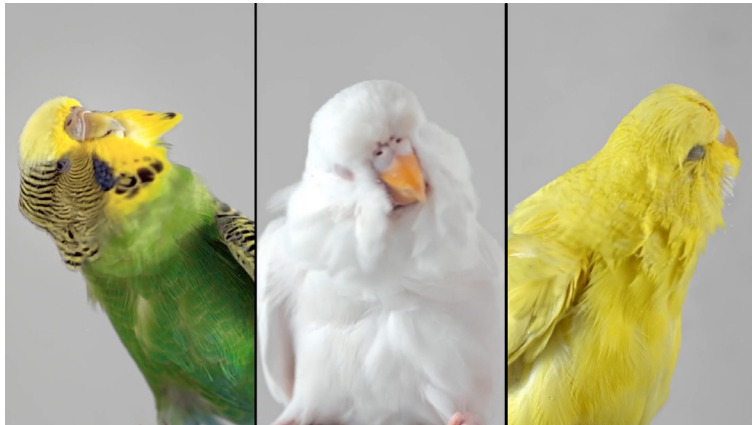
Nature is not a place to visit. It is home. Video still 2019