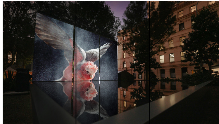
Temple (Installation view) VIVID Sydney 2022