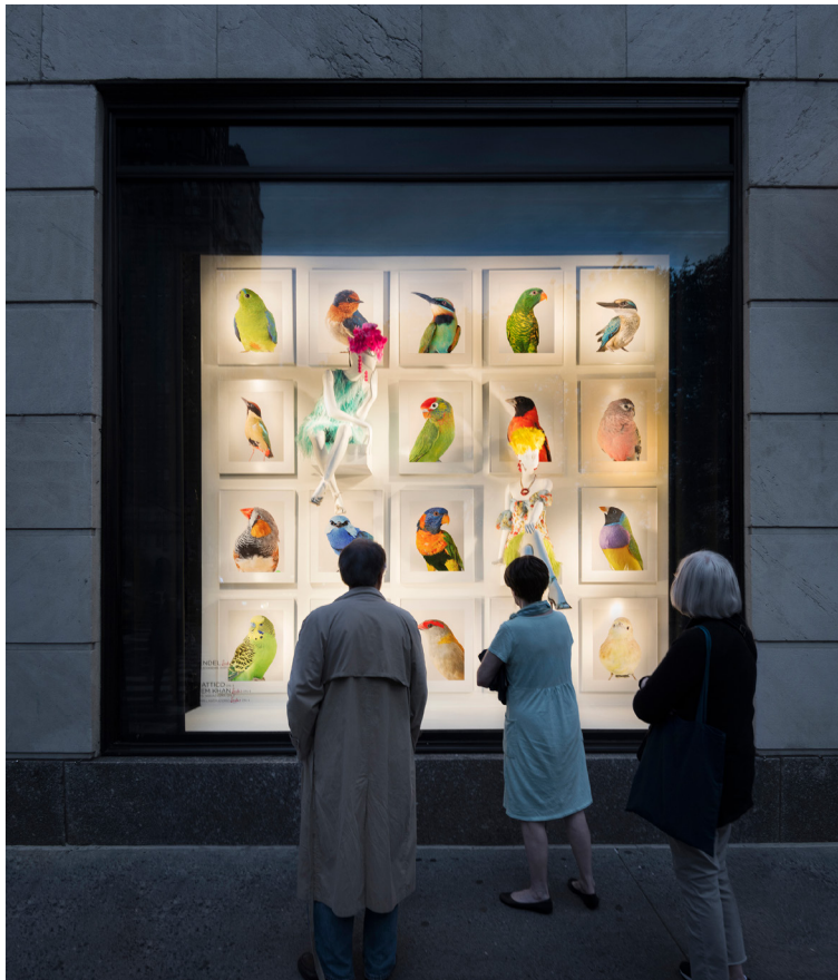
Bergdorf Goodman window installation New York City 2017